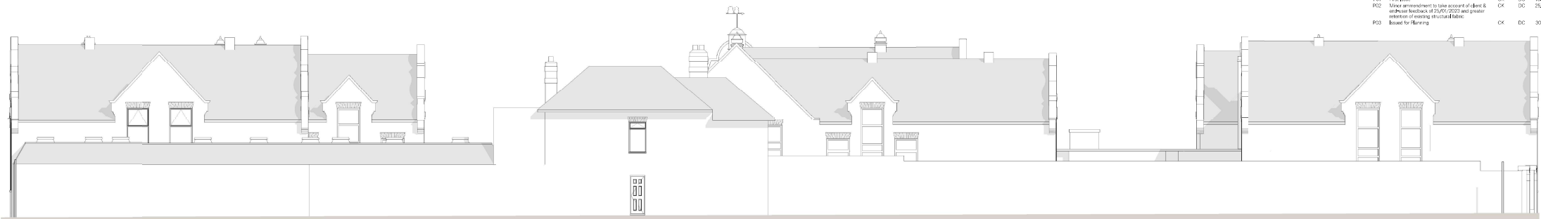
GA Elevation - Alley Way - Existing 1:100