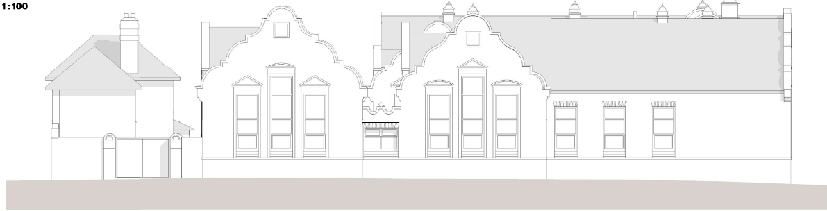
GA Elevation - Marlborough Lane - Existing 1:100