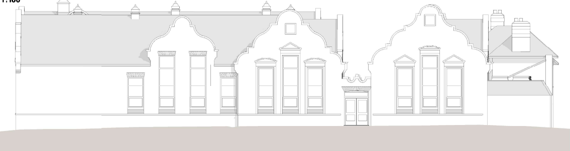
GA Elevation - Osbourne Road - Existing 1:100