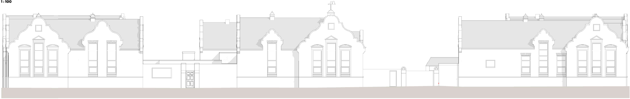
GA Elevation - Oxbridge Lane - Existing 1:100